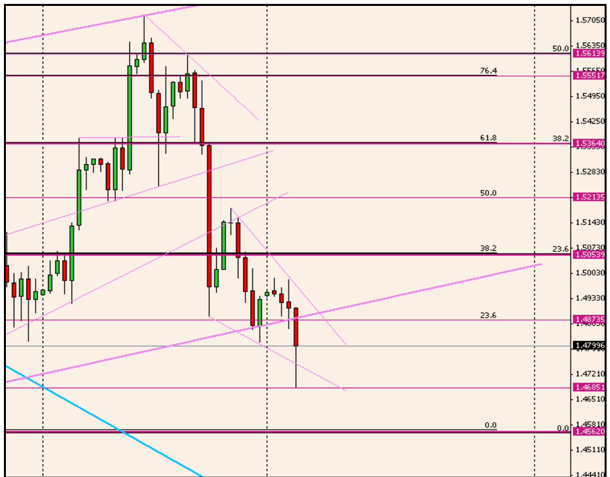
Chart 3 - GBPUSD 4-Hours