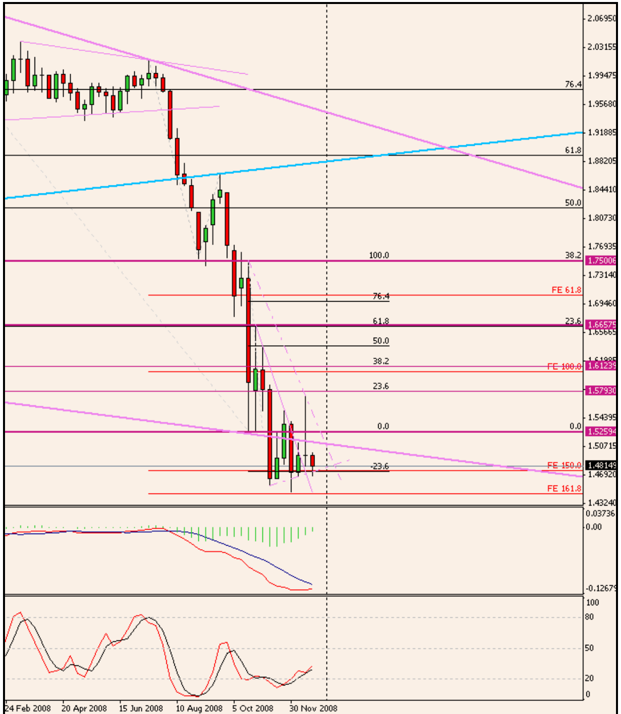
Chart 1 - GBPUSD Weekly

To know more about our services, please visit http://www.wfxadvisor.com