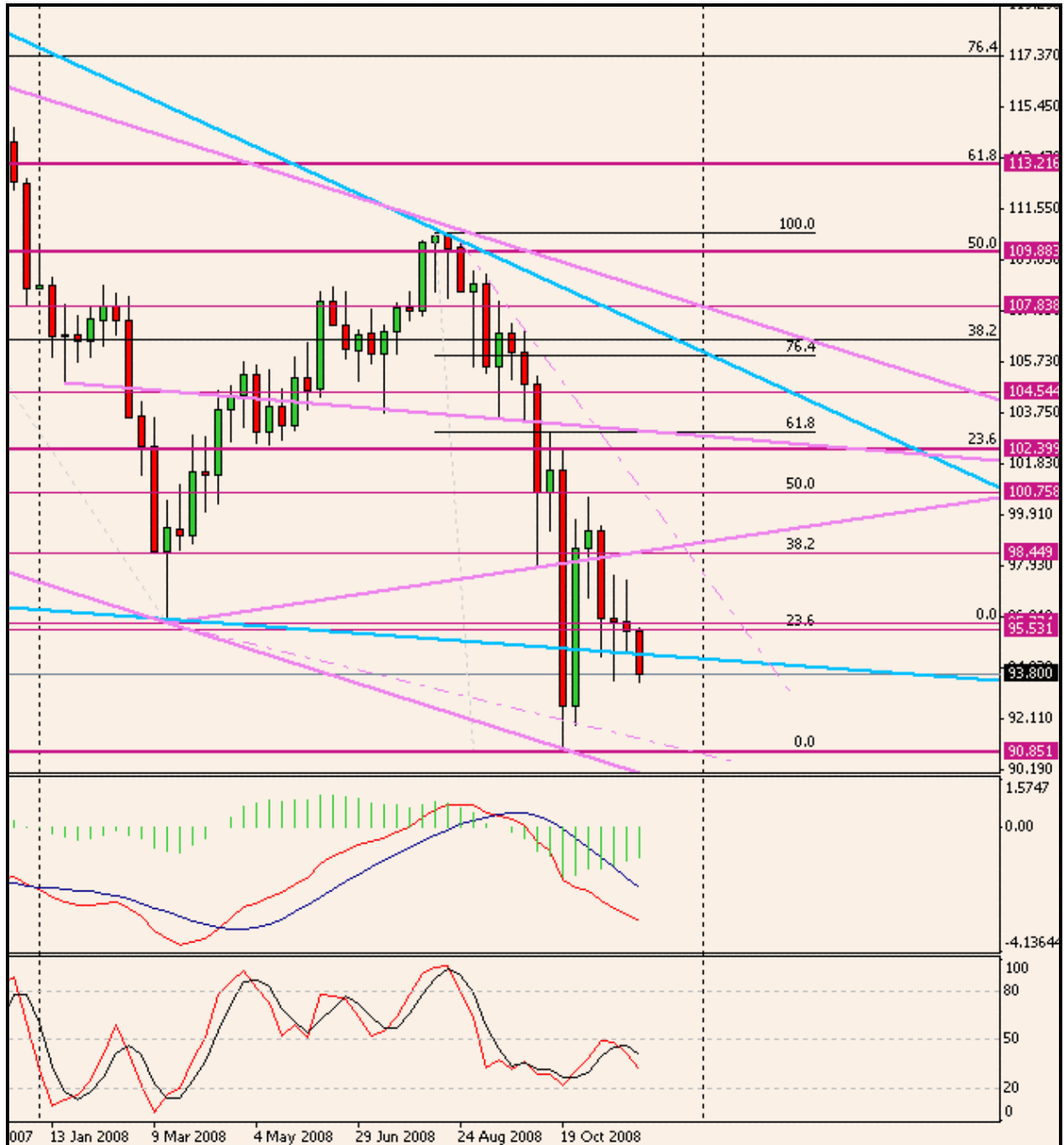
Chart 1 - USDJPY Weekly

To know more about our services, please visit http://www.wfxadvisor.com