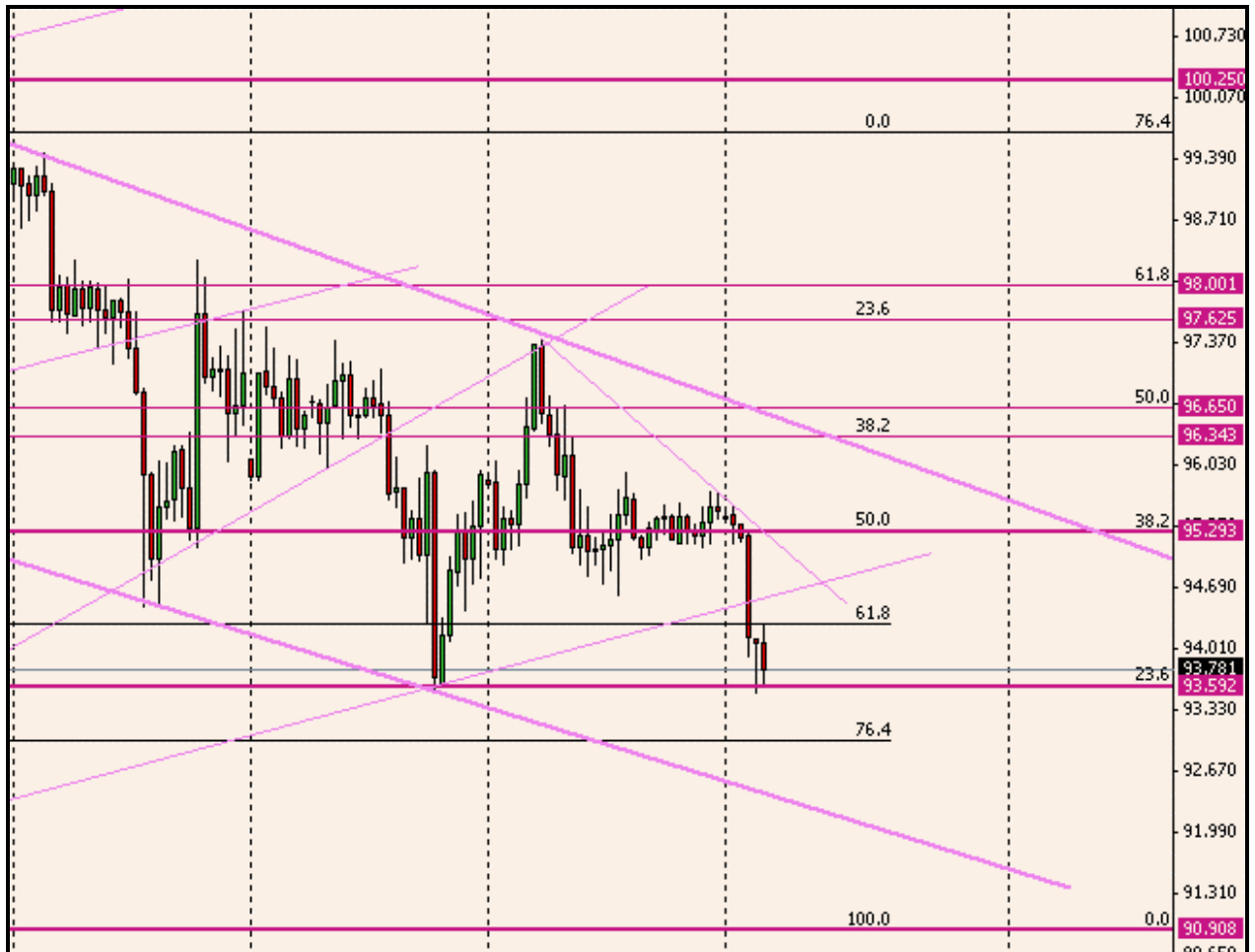
Chart 3 - USDJPY 4-Hours