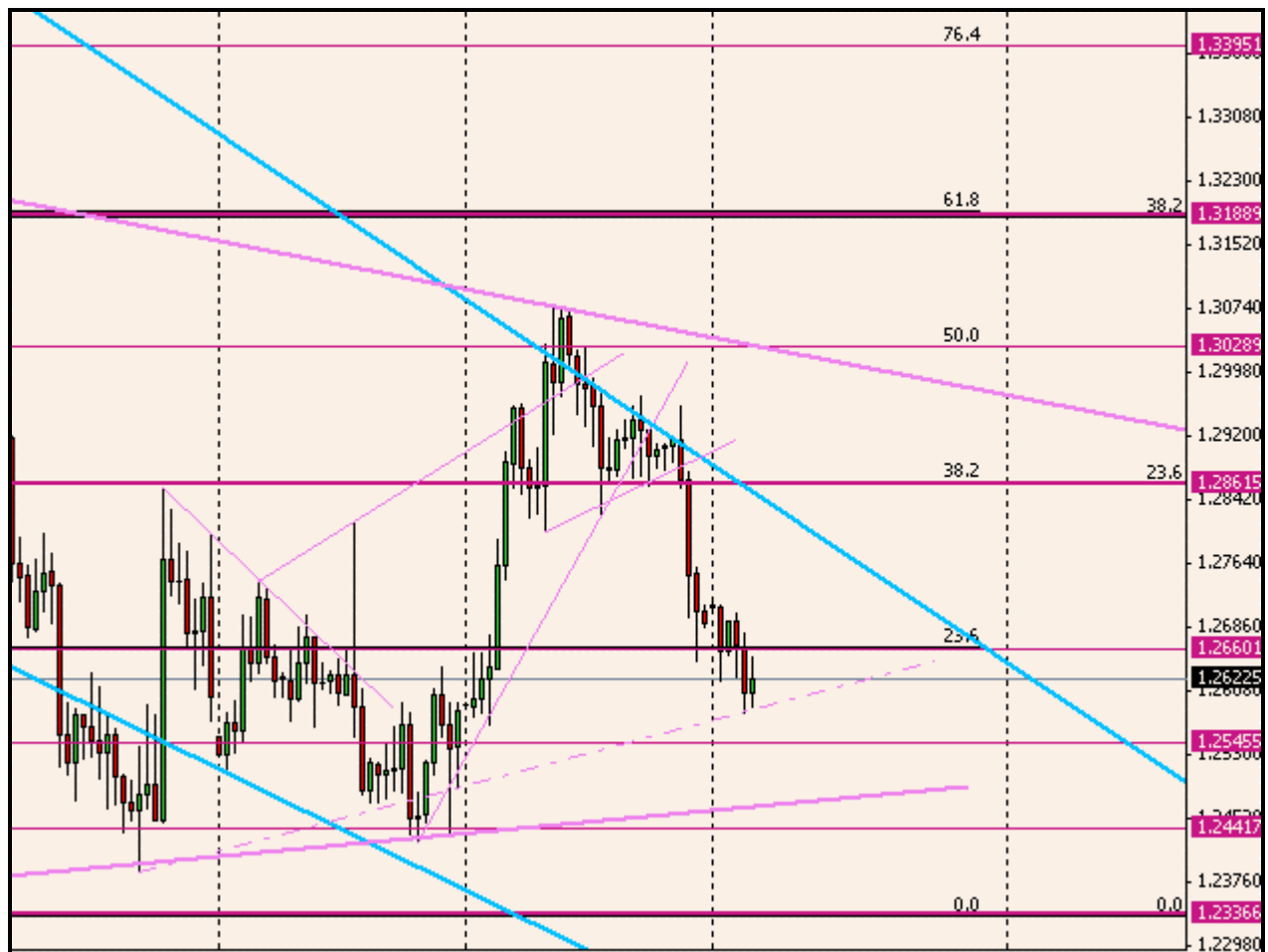
Chart 3 - EURUSD 4-Hours