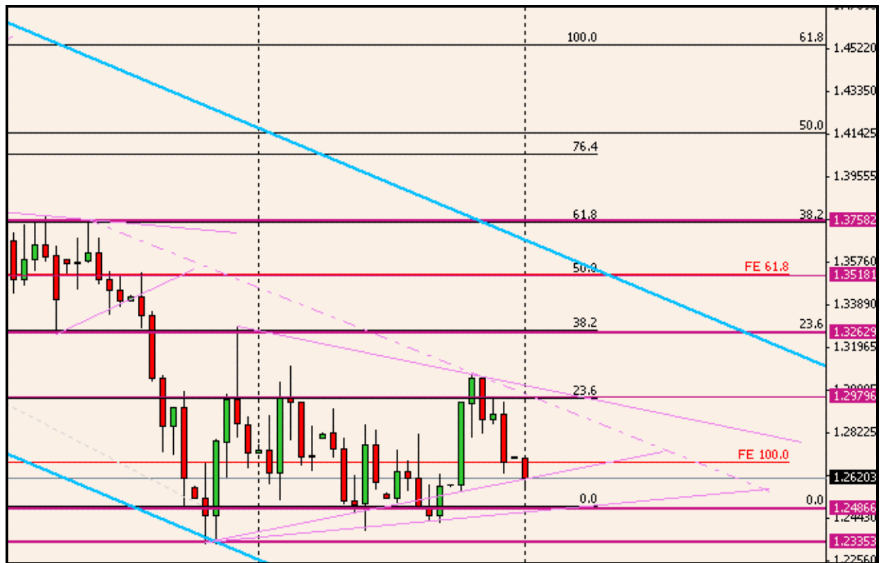
Chart 2 - EURUSD Daily